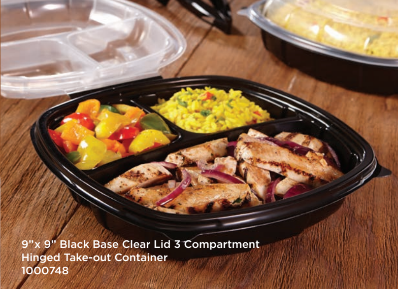
9"x 9" Black Base Clear Lid 3 Compartment Hinged Take-out Container 1000748