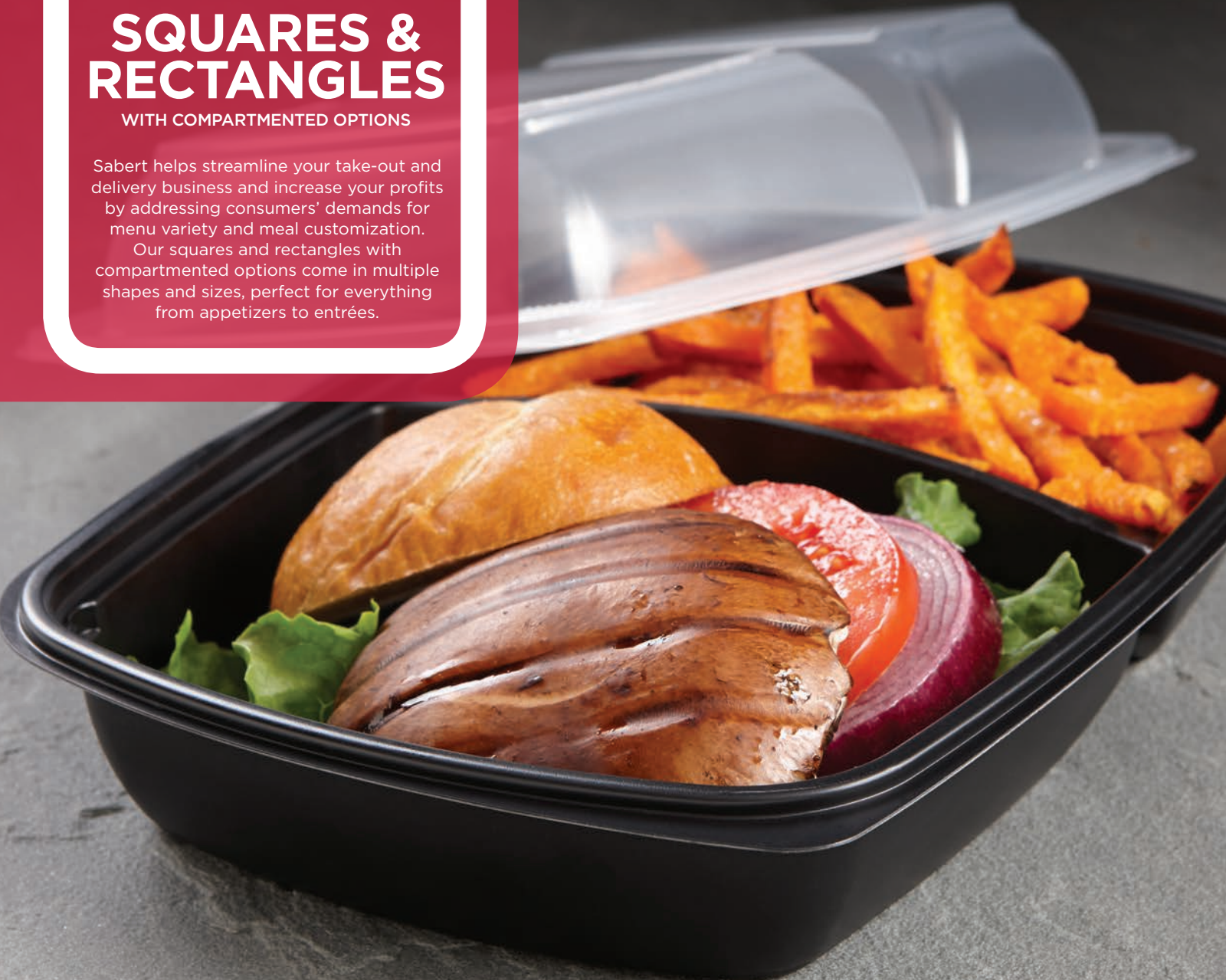
Black 27 oz. / 16 oz. Large Rectangle Two-Compartment Container 71243B150N

Our squares and rectangles with compartmented options come in multiple shapes and sizes, perfect for everything from appetizers to entrées.