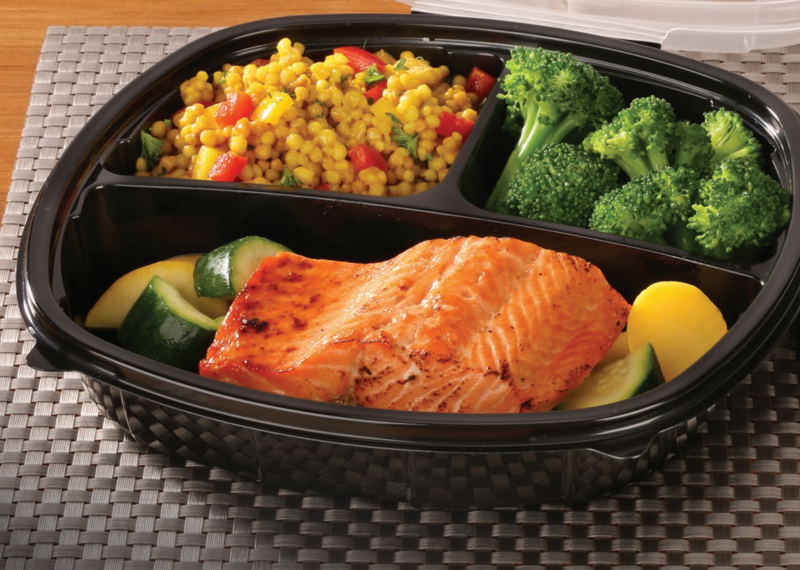
9"x 9" Black Base Clear Lid 3 Compartment Hinged Take-out Container 1000751

* Where facilities exist. Some may not be available in your area.