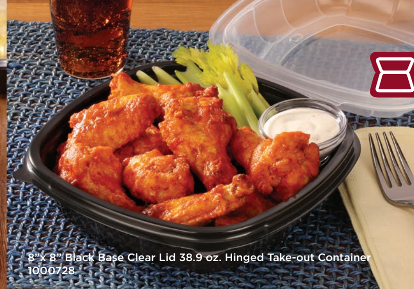
8"x 8" Black Base Clear Lid 38.9 oz. Hinged Take-out Container 1000728