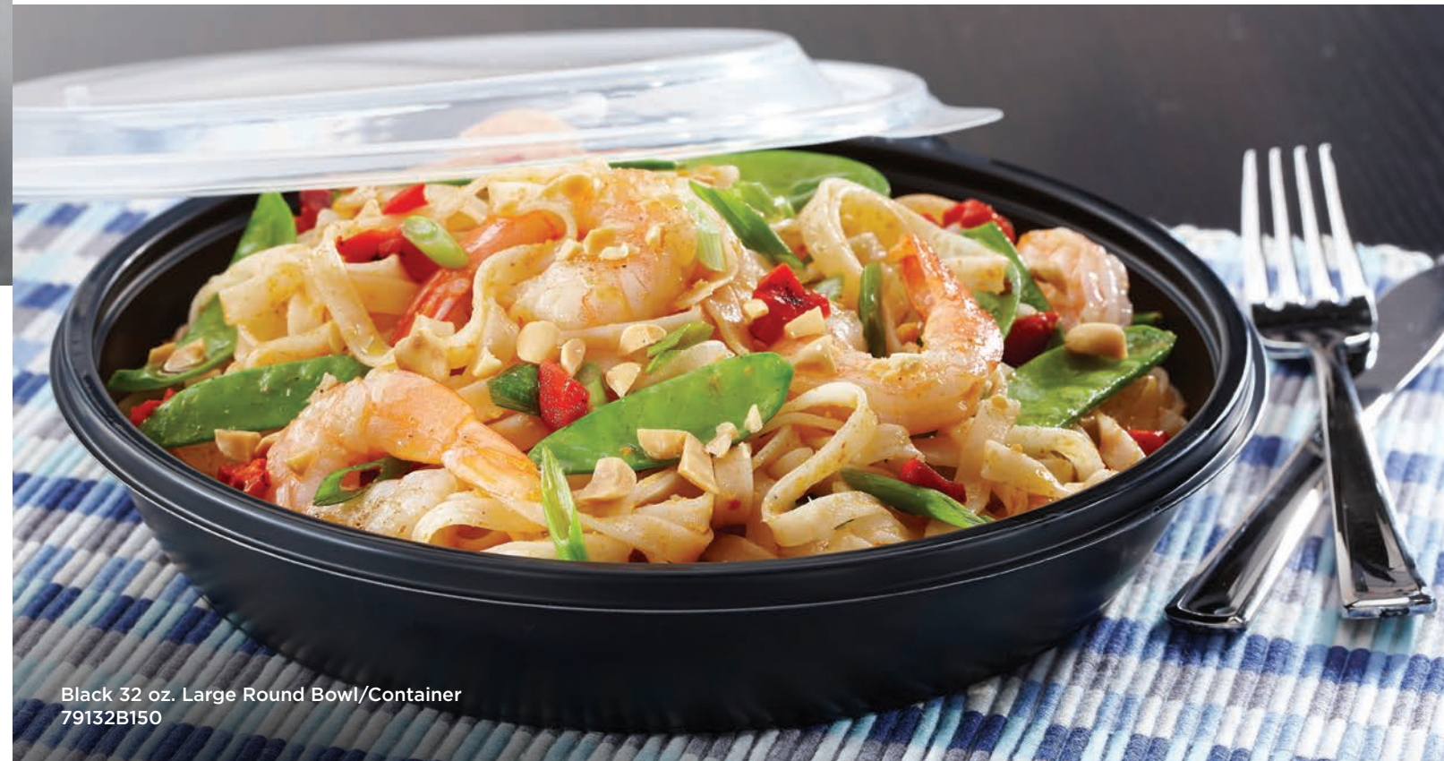
Black 32 oz. Large Round Bowl/Container 79132B150