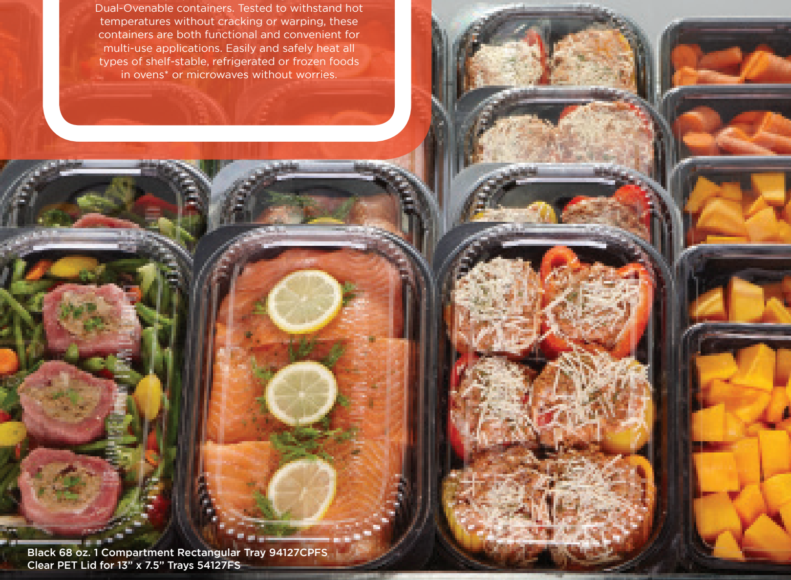
Black 68 oz. 1 Compartment Rectangular Tray 94127CPFS Clear PET Lid for 13" x 7.5" Trays 54127FS

Expand your prepared meal offerings with Sabert's Dual-Ovenable containers. Tested to withstand hot temperatures without cracking or warping, these containers are both functional and convenient for multi-use applications. Easily and safely heat all types of shelf-stable, refrigerated or frozen foods in ovens* or microwaves without worries.