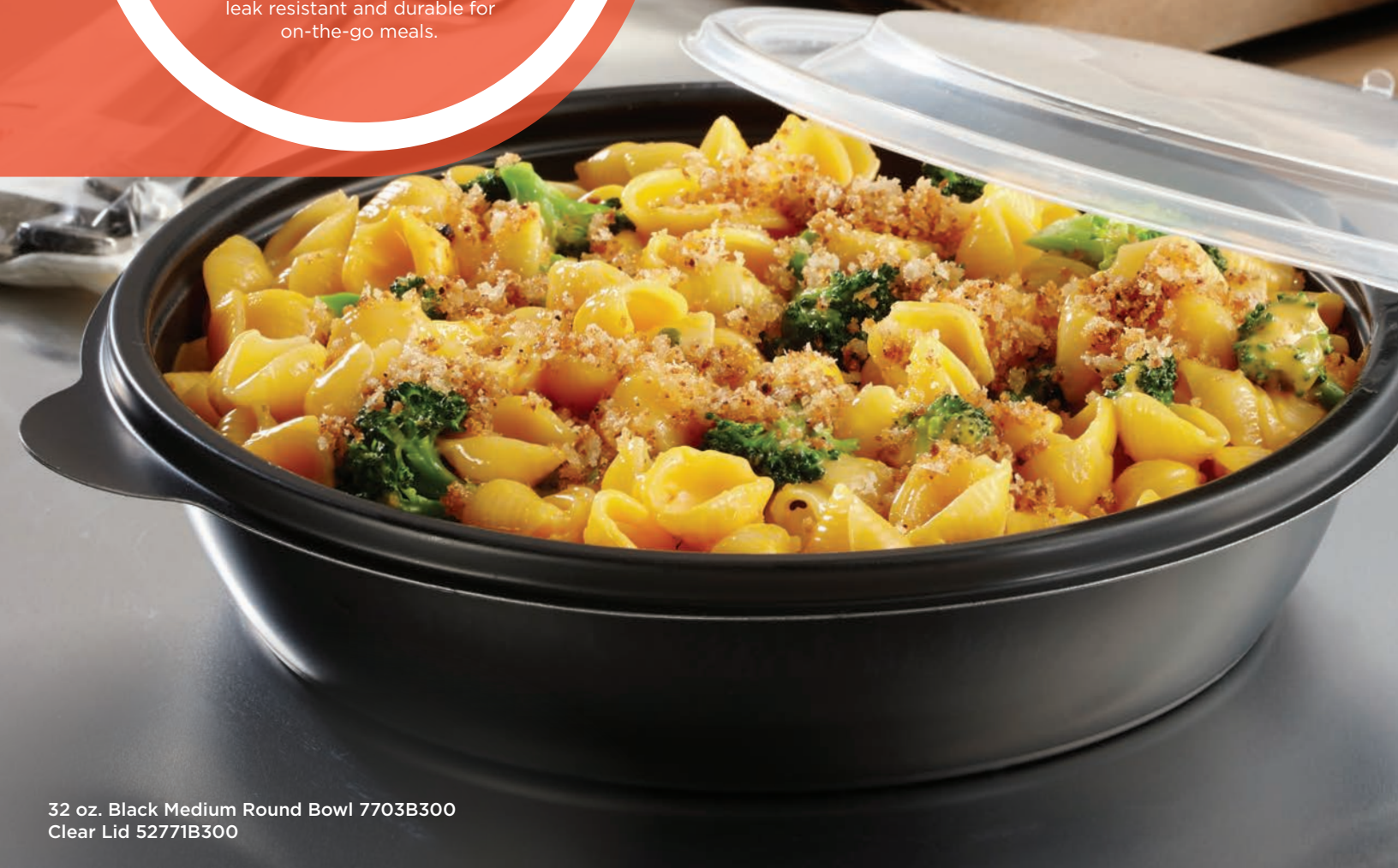
32 oz. Black Medium Round Bowl 7703B300 Clear Lid 52771B300

Keep menu creations hot, fresh and ready to be enjoyed with Sabert's innovative polypropylene packaging. Great for soups, sides or entrées in 6-32 oz. capacities, our packaging solutions are convenient, leak resistant and durable for on-the-go meals.