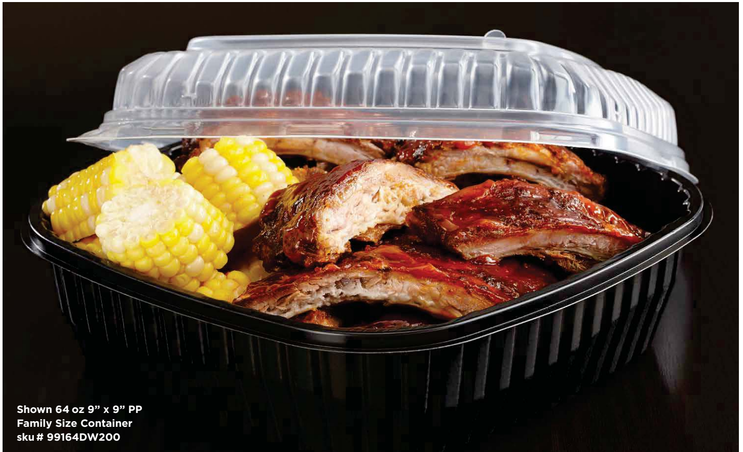
Shown 64 oz 9" x 9" PP Family Size Container sku # 99164DW200

Over 75% of consumers want packaging that is easy to transport and able to eat/serve from. 2