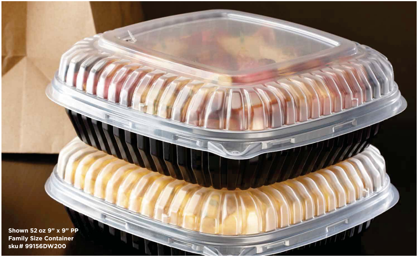
Shown 52 oz 9" x 9" PP Family Size Container sku # 99156DW200

Over 75% of consumers want packaging that is easy to transport and able to eat/serve from. 2